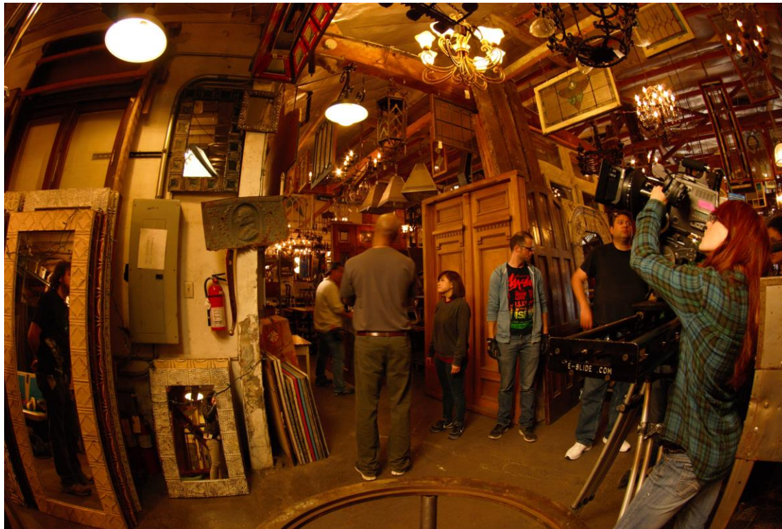
“Behind the scenes at Olde Good Things.”